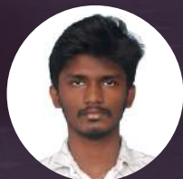
Maharaja K CGPA: 9.02