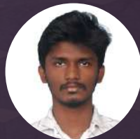
Maharaja K CGPA: 9.06